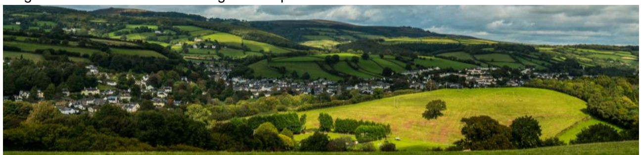
For more information on group travel in Newton Abbot and the rest of South Devon please visit www.visitsouthdevon.co.uk/grouptravel

An important part of Ashburton's history is the Office of Portreeve, not least because this ancient Saxon office is still kept alive today. Dating back to 820AD, the office is the only one now held by Act of Parliament. When the railway bypassed the town (in 1846), its future did not look bright, and Ashburton was largely forsaken until the 1950's when the quiet and beauty of the Dart Valley began to attract residents seeking an escape from urban life.